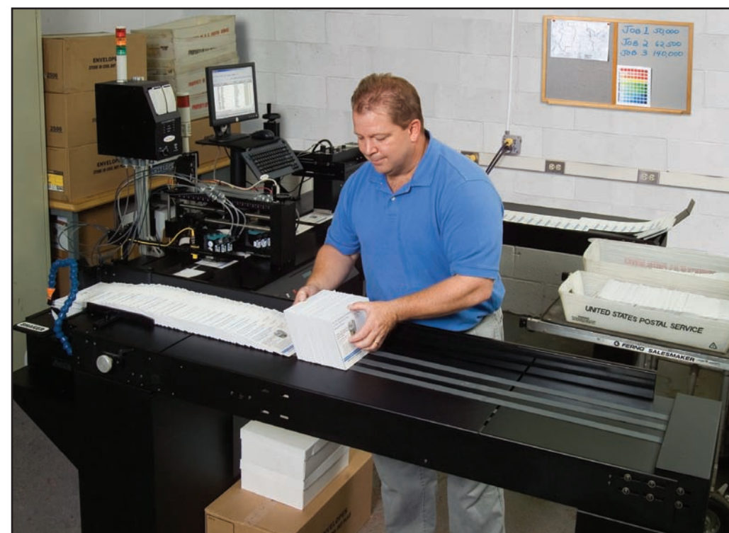
The UltraFeed™ high capacity feeder provides consistent and even feeding of media, moving high-volume jobs along faster for increased mailstream productivity.

High quality, flexible configurations, increased production and productivity, the ability to run both in-line and off-line, and superior imaging and print quality are some of the reasons why the Jet 1 system is the perfect solution for your mailing needs. It's an investment that pays for itself.